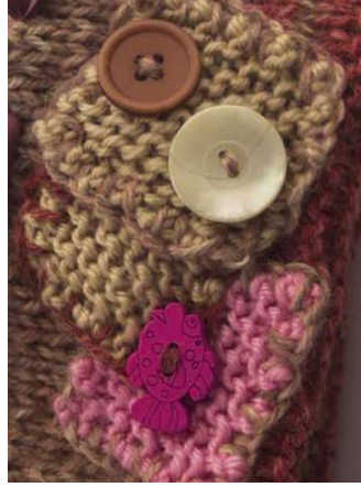
Knit contrast squares, or use scrap fabric, to create patches of interest on the twiddlemuff.