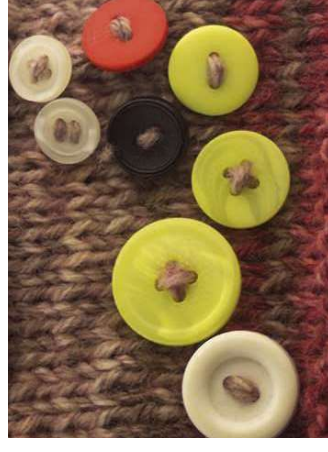
Bright buttons of different sizes are great for fidgeting hands and easily grab attention!