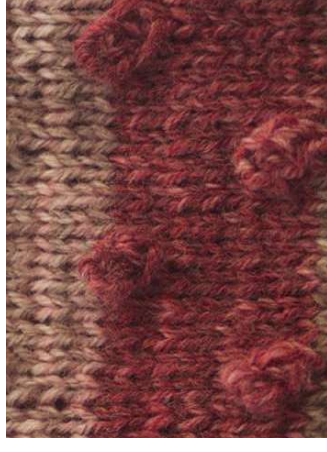
Add cute little bobbles to give the twiddlemuff a raised texture that stands out against st st.

For more James C. Brett patterns visit www.jamescbrett.co.uk .